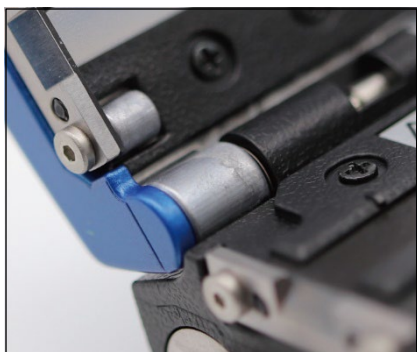
Tough Metal hinge