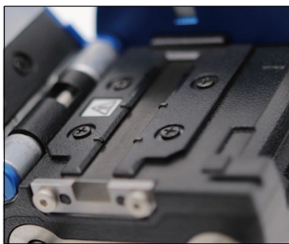
Flat stage for easy cleaning