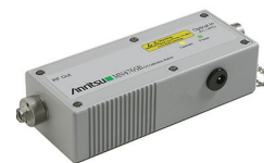
O/E Calibration Module MN4765B