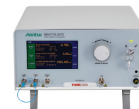
E/O Converter MN4775A