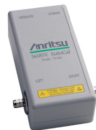
36585V Series AutoCal Module