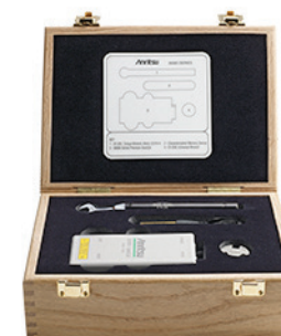
36585 Series Cal Kit