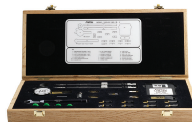
3654D Series Cal Kit