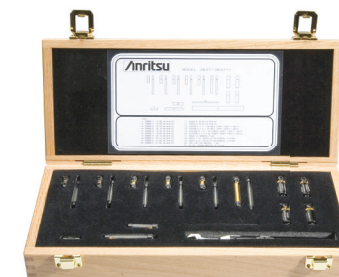
3657 Series V Cal Kit